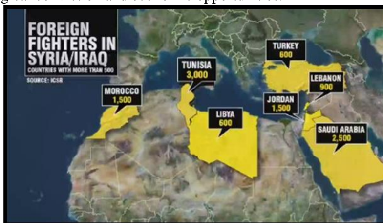
Fig.2 (Number of foreign fighter in Syria and Iraq)

Another key cause of the rise in jihadist activity in Tunisia is the increasing number of Tunisians who have traveled to Syria to fight against Bashar al-Assad regime. Tunisian foreign fighters in Syria [ an estimated 1,500 to 3,000 of the fighters are from Tunisia, ICSR - The International Centre for the Study of Radicalisation and Political Violence ] have fought alongside the al-Qa`ida linked Jabhat al-Nusra, as well as the most radical fighters of the Islamic State of Iraq and the Sham (ISIS). Motives for fighting in Syria include ideological conviction and economic opportunities.