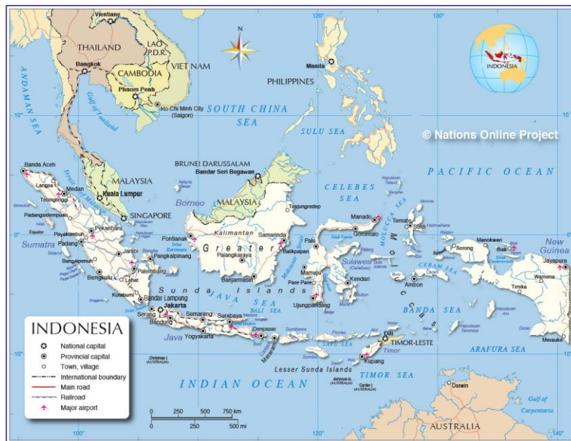
Fig 3: Political map of the Indonesian Archipelago and Malaysia 34

This is how Chinese naval base location in the islands of Sumatra and Kalimantan, for example, exert direct influence not only upon the Straits of Malacca but also on the rest of the region, as can be seen in Fig.2. Chinese military plans in Indonesian waters are supported by a strong community of Chinese nationals and companies operating in the region reunited in the so-called bamboo network 35 . According to the 2010 census, there are more than 2.8 million Chinese living in the Indonesian Archipelago, representing 1.2% of the total population of the country 36 . But unofficial sources claim that the number of ethnic Chinese living in Indonesia would reach between 10 and 12 million people, including some who are 3rd and 4th generation, but who declared themselves Indonesians.