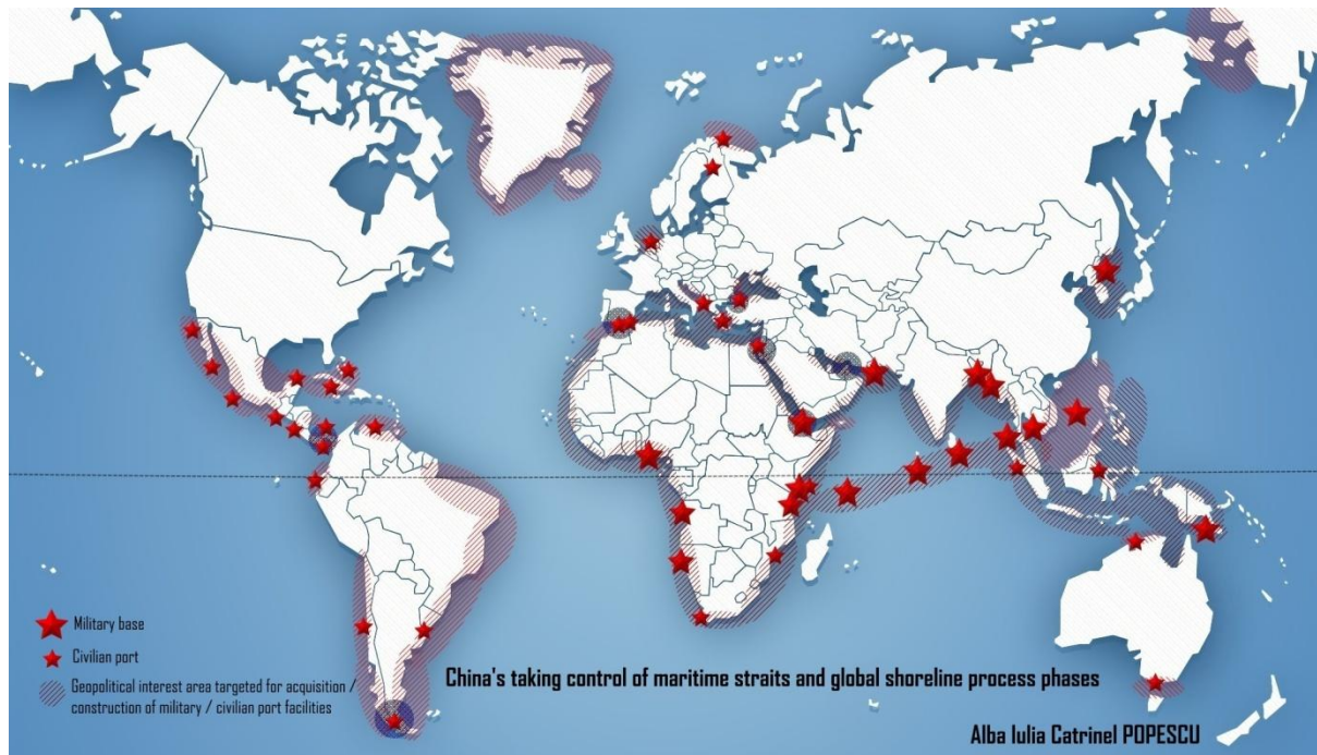
Fig 4: China's taking control of maritime straits and global shoreline process phases

Danish straits absence from China's immediate strategic objectives list, as well as the failure of taking over Iranian Chabahar Port's management or the failure of taking over the Black Sea ports' economic control should be regarded as the result of a non-combat policy towards Russia with which Beijing does not want to tighten the relations, for the moment.